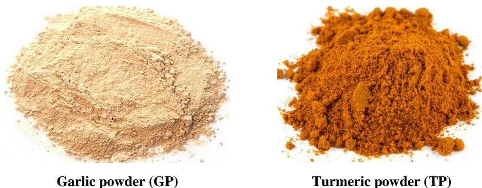
Fig. 1. Preparation of garlic and turmeric powder