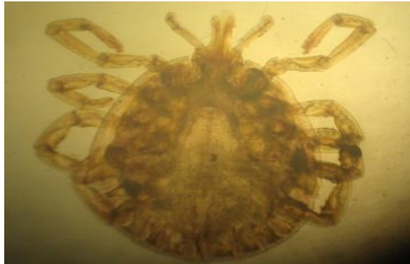
Fig. 3. A. testudinarium at 40X magnification