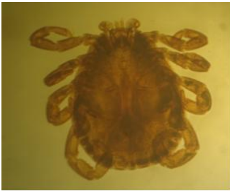
Fig. 4. H. bispinosa at 40X magnification