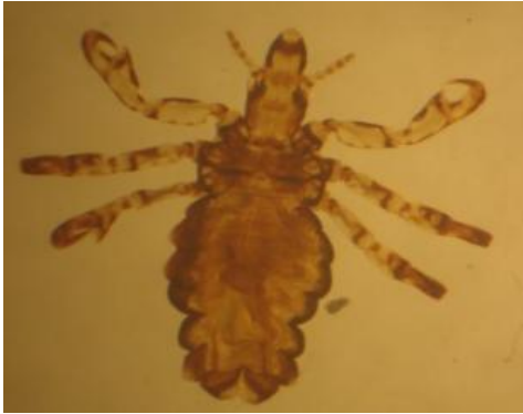
Fig. 2. H. suis at 40X magnification