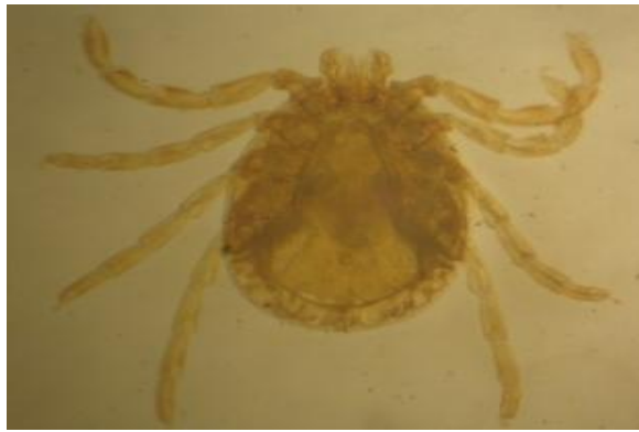
Fig. 5. R. sanguineus at 40X magnification