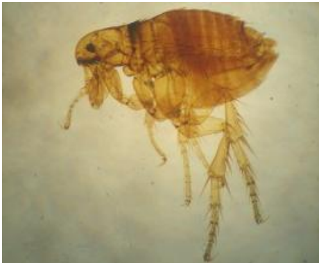
Fig. 6. C. canis at 40X magnification