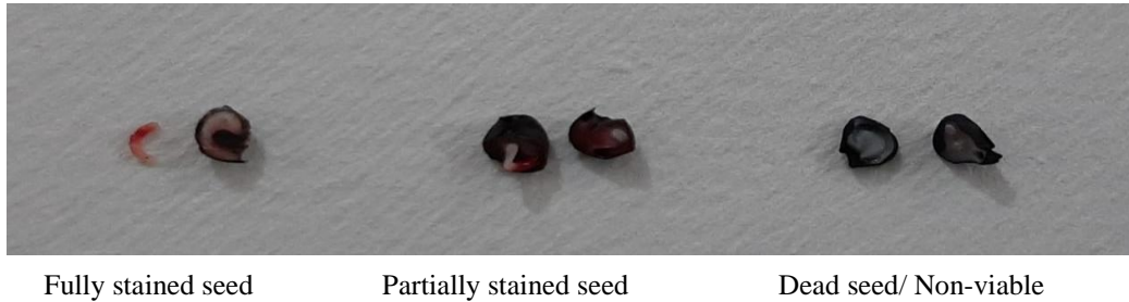
Fig. 1. Different stained condition of onion seed after viability test