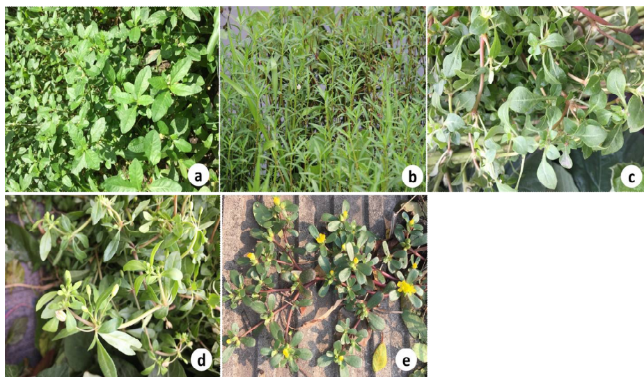
Fig. 1. Fresh samples of five studied leafy vegetables namely, (a) Alternanthera sessilis , (b) A. philoxeroides , (c) A. paronychioides , (d) Glinus oppositifolius and (e) Portulaca oleracea .

Concentrated extracts were stored at 4° C for further analysis.