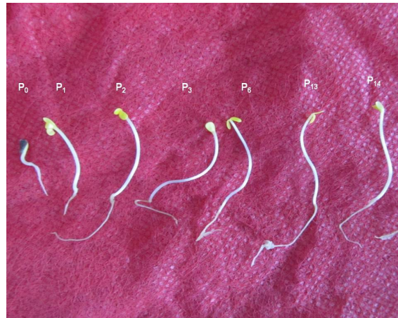
Fig. 1. Visual differences of various treatments on seedling vigour.

conditioning promotes the occurrence of pre-germinative metabolic events enabling embryo growth, and thus increasing the speed of germination and thus reduced MGT (Afzal et al. 2012). On the other hand, improved MGT with \text{KNO}_3 attributes to its role in impacting the turgidity of cell wall and leads to activation of many enzymes associated with protein synthesis and carbohydrate metabolism. Besides, the nutrient potassium is having influence in osmoregulation. Similar results of improved MGT, and Germination rate with \text{KNO}_3 priming were reported in Gladiolus alatus (Mushtaq et al. 2012), and Brassica napus L. (Abdollahi and Jafari 2012).