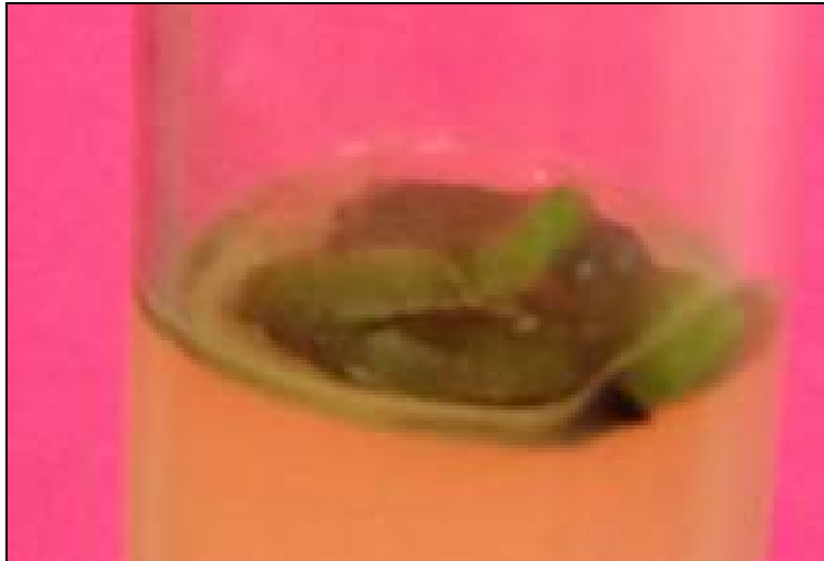
Fig. 1. Regeneration of leaf explant of Aloe vera in MS basal medium supplemented with BAP (1.0 mg/l) and NAA (1 mg/l) after 45 days of inoculation.

Effects of different explants i.e. leaf internode and node on MS medium supplemented with different concentrations PGRs were investigated. It was observed that leaf explants proved to be the best for in vitro growth of A. vera L. (Table 1 and Fig. 1). The leaf explants showed maximum i.e. (96%) in vitro growth on MS basal medium supplemented with BAP (1.0 mg/l) and NAA (1.0 mg/l) (Fig. 2). Different physical conditions were adjusted i.e. 24 \pm 2^\circ\text{C} , 3% sucrose, pH 5.7 and 16 hrs of photoperiod, respectively. Although comparatively lesser callus (90%) was formed with BAP (3.0 mg/l) in MS medium using leaf explants under the same above mentioned physical conditions.