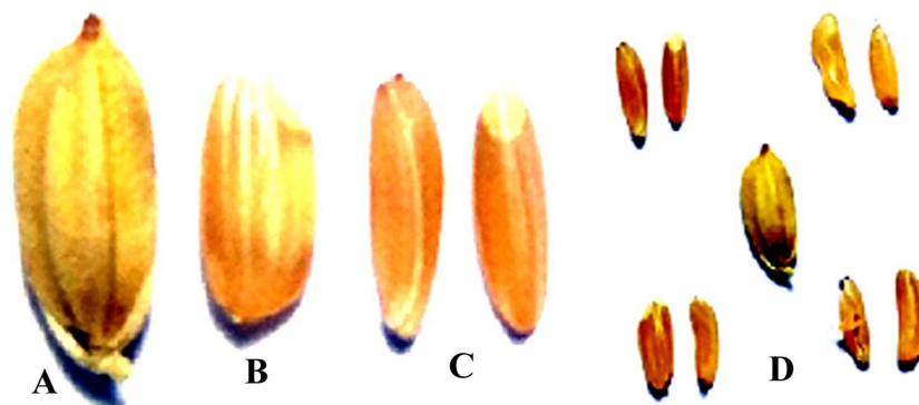
Fig. 1. Double grained rice spikelet. A. A spikelet, B. Single grain and C-D. Double grains

Data recorded for yield and yield contributing characters were compiled and tabulated in proper form for statistical analyses following MSTAT-C computer package programme (Russel 1986). The mean differences among treatment were adjudged with DMRT at p < 5\% (Gomez and Gomez 1984).