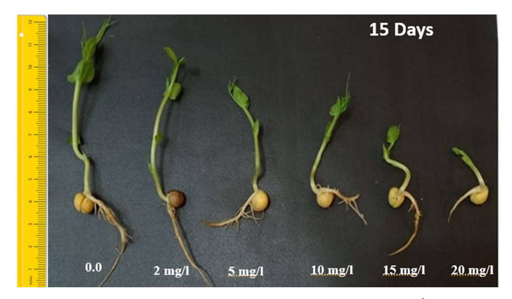
Fig. 2. Image representing the outcomes of BPA on the growth of pea seedlings on the 15<sup>th</sup> day after pea seeds were sown.

After sowing on 30^{\text{th}} day, there was an increase in plant height (2.98%) (Figs 1 and 3), fresh weight of leaves (20.23%) and decrease in dry weight of leaves (9.90%), fresh weight of stems (13.95%), dry weight of stems (60.58%) in 2 mg/l and in case of 5 to 25 mg/l BPA treated pea seedlings; plant height, fresh and dry weight of leaves and fresh and dry weight of stems were decreased by (21.89, 91.25, 23.42, 10.87 and 4.61%) at 5 mg/l; (15.39, 14.49, 39.93, 21.68 and 27.67%) at 10 mg/l; (37.29, 27.54, 40.54,19.20 and 46.54%) at 15 mg/l; (42.62, 42.03, 53.45, 26.70 and 57.86 %) at 20 mg/l and (57.48, 45.03, 69.96, 60.84 and 74.63%) at 25 mg/l respectively when compared to control as shown in (Table 2.)