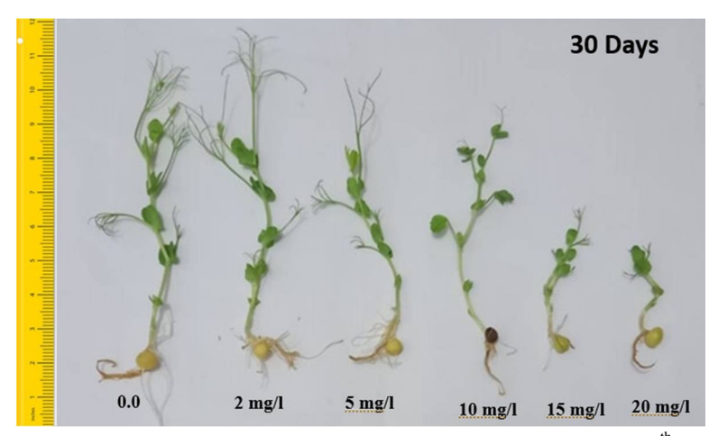
Fig. 3. Image representing the outcomes of BPA on the growth of pea seedlings on the 30<sup>th</sup> day after pea seeds were sown.

Fig. 4 illustrates the outcome of chlorophyll content in pea seedlings treated with 2 to 25 mg/l BPA for 15 and 30 days after sowing. In case of 15 days BPA treatment, chlorophyll content was found to decrease in 2 mg/l (13.46%), 5 mg/l (19.82%), 10 mg/l (21.70%, p < 0.05), 15 mg/l (32.50%, p < 0.01), 20 mg/l (43.86%, p < 0.01) and 25 mg/l (49.54%, p < 0.01) respectively in comparison to control. Similar pattern were reported after 30 days BPA treatment which were (14.38%) in 2 mg/l, (13.01%) in 5 mg/l, (29.31%, p < 0.01) in 10 mg/l, (37.46%, p < 0.01) in 15 mg/l, (47.53%, p < 0.01) in 20 mg/l and (58.08%, p < 0.01) in 25 mg/l respectively in comparison to control.