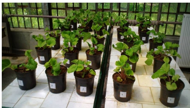
Fig. 1. Growth phase of German primula with different treatments under greenhouse condition.

among the treatments of HHW 4 (100% HHW, 25% peat + 75% HHW), and HHW 2 (50% peat + 50% HHW), so all these three treatments were classified in the same statistical group. The DMRT analysis revealed that the plants grown in HHW 2 (50% peat + 50% HHW) had highest mean flower weight of 0.150 g, and the control plants had the lowest (0.097 g) value (Table 3, Fig. 7). While, rest of the treatments did not show any signification variations.