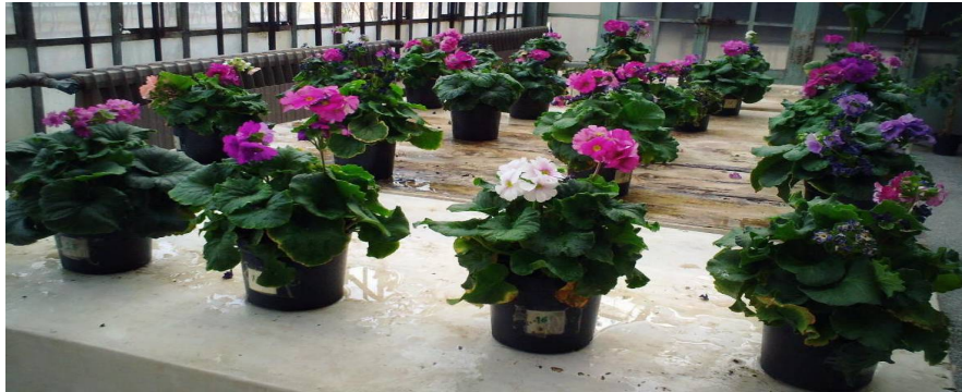
Fig. 4. General view of the differences in the total flower number of the German primula plant in hazelnut husk waste treatment.