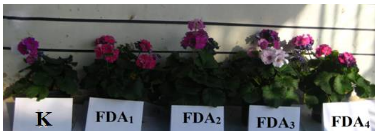
Fig. 2. Different treatments on German primula. K=Control (% 100 peat), FDA 1 =HHW1(% 75peat + % 25 hazelnut husk waste), FDA 2 =HHW2(% 50peat + % 50 hazelnut husk waste), FDA 3 =HHW3 (% 25 peat + % 75 hazelnut husk waste), FDA 4 = HHW4 (% 100 hazelnut husk waste )