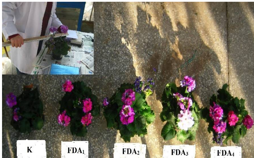
Fig. 5. General view of the differences in the crown width of the German primula by the hazelnut husk waste. K=Control (% 100 peat), FDA1 =HHW1(% 75peat + % 25 hazelnut husk waste), FDA2 =HHW2(% 50peat + % 50 hazelnut husk waste), FDA3 =HHW3 (% 25 peat + % 75 hazelnut husk waste), FDA4 = HHW4 (% 100 hazelnut husk waste).

In the recorded qualitative parameters, only esthetic appearance scores and the mean flower weight values were significantly altered by the addition of hazelnut husk waste (HHW) (at the P < 0.05 and P < 0.001 levels, respectively). Whereas, qualitative parameters such as the number of flower stem, overall blossom count, size of plant canopy, height and leaf numbers were not affected by HHW treatment. The qualitative traits of the plants grown in composted hazelnut husks were superior or even close to the control treatment. The second and third highest scores were obtained from the growth media containing 75 and 50% HHW, respectively. The least amount was also related to the control in which the plants were grown in 100% peat. The two studied groups of the plants (grown in HHW-containing and HHW-free media) remarkably differed in apparent beauty and the good feeling that they provoke in humans at the first sight.