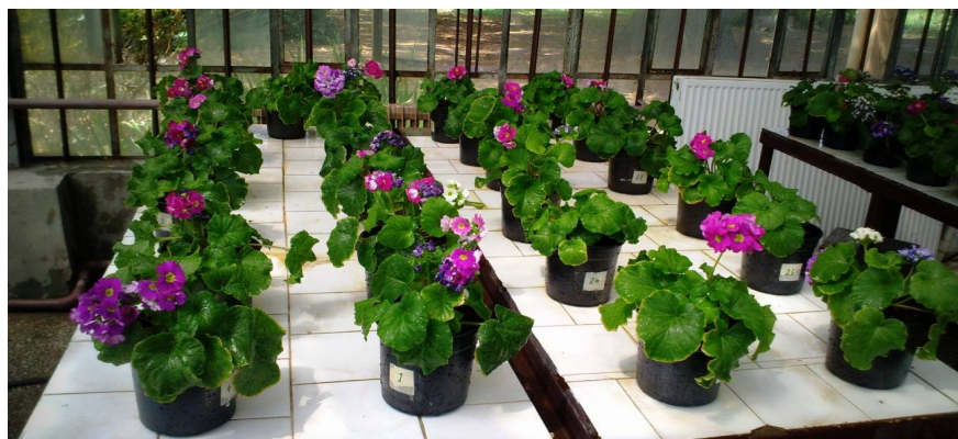
Fig. 3. General view of the differences in the number of flower shoots of the German primula plant by the hazelnut husk waste.