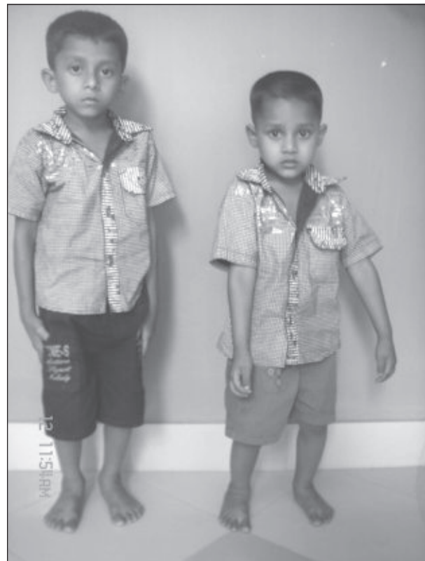
Fig.-1: Two brothers with HSP

On examination, speech was normal but he lacked spontaneity. His height and weight was within normal limit. Examination of the lower extremity showed a bilateral equinovarus deformity, paraparesis, spasticity, hyperreflexia (4+ DTR) of both ankles,