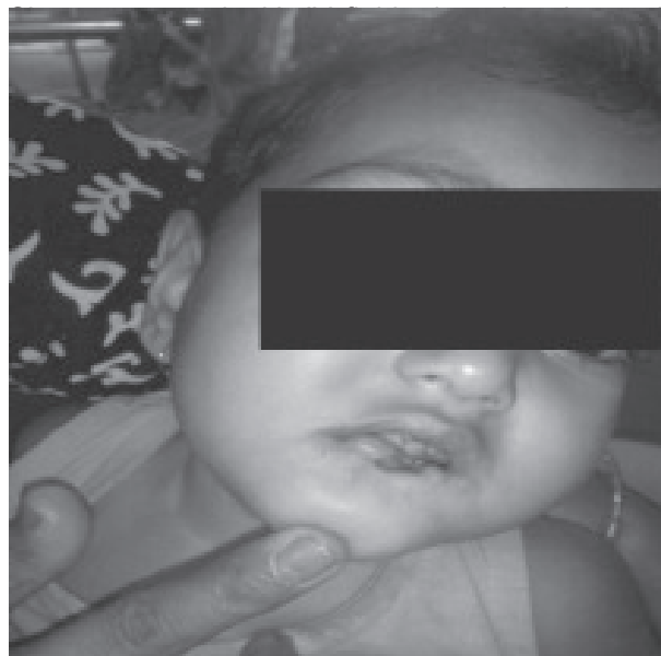
Fig-1: Cut injury over lower lip.

But after 7 days of discharge she developed swelling of the left leg which started from ankle and extended up to mid thigh. She was fretful, temperature 100 o F, radial pulse rate 110 per minutes, respiratory rate 24 breaths per minutes and blood pressure was 80/40 mmHg (50 th centile), periphery was cool and capillary refill time was 3 seconds. Lower limb examination reveals swelling in right leg (from ankle joint to mid thigh). Skin was shiny, no color changes, temperature was normal compared to the opposite limb and was non tender, pulse in the lower limbs were normal. Investigation: complete blood count and urine RME revealed normal. Prothrombin time (PT) was 13.1 second, international normalized ratio (INR) 1.1; D-dimer 49.35 mg/dl; fibrin degradation product (FDP) 10 ug/dl. Color duplex of right lower limbs revealed thrombus in the right saphenous vein. So, she was diagnosed as LNS with hypovolemic shock with deep vein thrombosis (right lower limb).