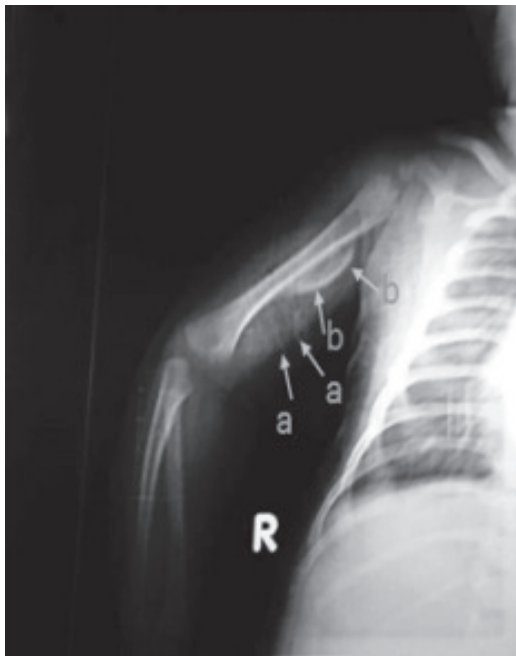
Fig. 1(d): X-ray right upper limb

diagnosis of Caffey disease was made and no medication was advised. On first follow-up two weeks after discharge, right leg swelling completely disappeared, the swelling on left leg was getting smaller. In next two weeks there was further regression of the swelling and no new complaint was mentioned.