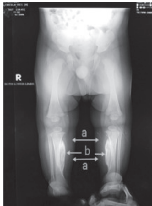
Fig. 1(e): X-ray both lower limbs

Radiographs of long bones (Humerus and Tibiae) showing (a) overlying soft tissue swelling and (b) cortical thickening in the diaphyses sparing metaphases and epiphyses