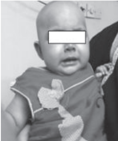
Fig.-5: The child 2 months after surgery

scan of Chest that showed multiple small sized cystic areas in apical, posterior basal and lateral basal segments of left lower lobe. Small air space solid lesion is seen in apical and basal segments of lower lobe with slight shifting of mediastinum to left – suggestive of type II congenital pulmonary airway malformation of left lower lobe of lung with small consolidation of left lower lobe with left sided pleural effusion. So our final diagnosis was Congenital pulmonary airway malformation (CPAM) with pneumonic consolidation. The girl became afebrile after 5 days of hospital stay. Respiratory distress and general condition improved gradually. A full course of antibiotic treatment was given. Then she was referred to thoracic surgeon for surgical resection. The baby underwent lobectomy and her postsurgical period was uneventful. After the surgery, baby is doing well for last 6 months without any major respiratory symptoms. Now she is developmentally age appropriate having normal growth. Presently, at the age of 1 year, her weight is 9.6 kg, length 75cm, W/H on 50th centile and L/A on 75th centile, OFC 45 cm that falls on 50th centile.