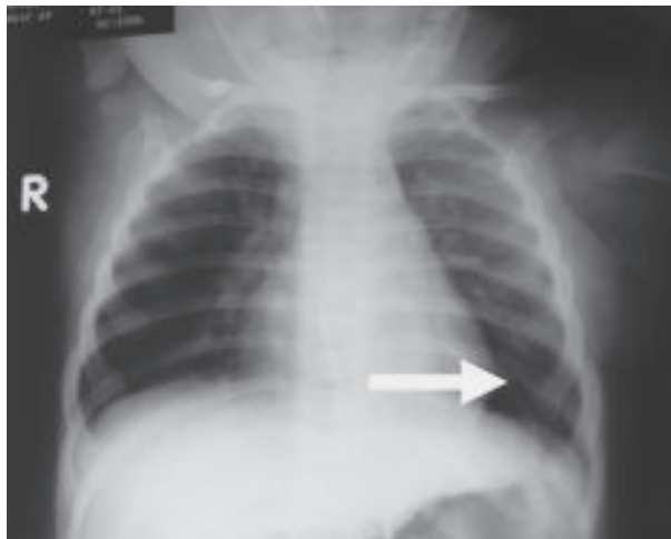
Fig:1 Normal chest x-ray except some increased translucency at left cardiophrenic region.

Protein (CRP) 334 mg/ L. Chest X Ray (CXR) findings was normal except some increased translucency at left cardiophrenic region. An echocardiogram was performed to exclude cardiac anomalies that revealed Patent Foramen Ovale (PFO). Blood and urine culture showed no growth. Septicaemia with PFO was then considered. She was given Inj. Ceftriaxon in addition to other symptomatic and supportive treatment. For persistent irritability, continuous crying and gastrointestinal tract symptoms an ultrasonography (USG) of abdomen was performed that incidentally revealed 7.4 x 4.3 cm sized echogenic area with multiple cystic and hypoechoic lesions seen in the left pleural space adjacent to the heart. This findings directed us to perform a Computed tomography (CT)