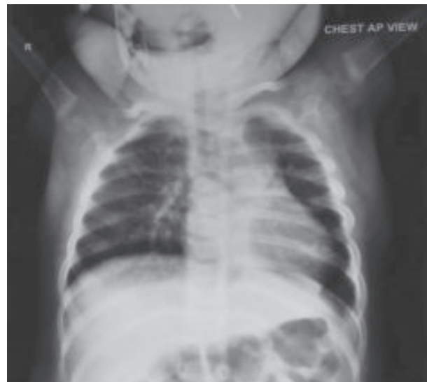
Fig.-3: Follow-up chest x-ray one month after surgery