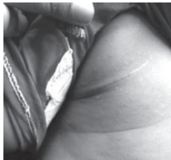
Fig.-4: Post surgical incision mark