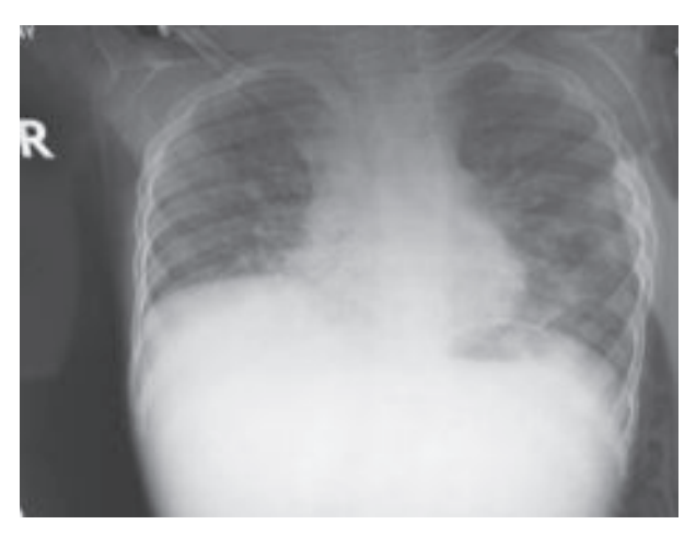
Fig.-2 : Chest X-ray showing bilateral diffuse pulmonary infiltration.

abdomen shows marked hepatosplenomegaly (liver 11.7 cm and spleen 11.4cm). There was no varix in upper GI endoscopy. Chest X-ray shows diffuse pulmonary infiltration bilaterally (Figure 2). There are cherry red spot in both eyes on ophthalmologic