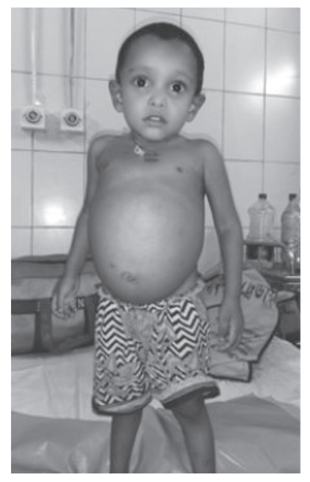
Fig.-1: Abdominal distention, short stature.

abdomen shows marked hepatosplenomegaly (liver 11.7 cm and spleen 11.4cm). There was no varix in upper GI endoscopy. Chest X-ray shows diffuse pulmonary infiltration bilaterally (Figure 2). There are cherry red spot in both eyes on ophthalmologic