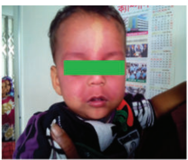
Fig.-1: Port wine stain (Sturge weber syndrome)