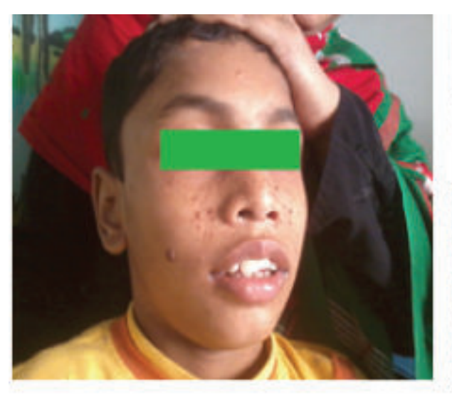
Fig.-1: Facial angiofibroma (Tuberous sclerosis)

hypomelanotic macule (76.90%), shagreen patch (76.90%). In ataxia telangiectasia, common presentation was ataxia (100%), ocular telangiectasia (62.50%). In Sturge weber syndrome common presentation was facial capillary malformation (100%). Neurofibromatosis was presented with neurofibroma (100%), café-au-lait spot (100%). Common systemic manifestations of NCS was found in TSC. Those were multicystic kidney disease (30.76%), ASD (15.38%) & ADHD(7.69%).