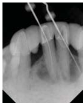
Figure 4: Radiographic Representation of Iatrogenic lesions

4. Iatrogenic lesions: usually endodontic lesions are produced as a result of treatment modalities.