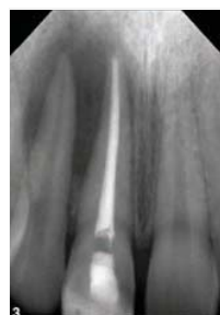
Figure 6: Primary endodontic lesion treated endodontically