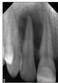
Figure 5: Primary endodontic lesion treated endodontically

Treatment of primary endodontic lesions: According to Simon et. al. root canal therapy should be performed with multiple appointments. Healing is rapid and is usually accomplished within 3-6 months 49 (Figure: 5-7).