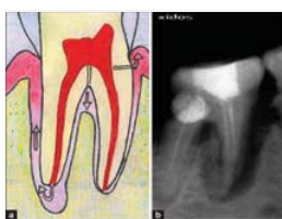
Figure 1: Diagrammatic & Radiographic Representation of Endodontic lesion

1. Endodontic lesions: an inflammatory process in the periodontal tissues resulting from noxious agents present in the root canal system of the tooth.