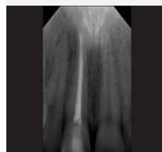
Figure 7: Complete healing after 6 months

Treatment of primary endodontic lesion with secondary periodontal involvement: It necessitates both endodontic and periodontal treatment as there is pulpal involvement and presence of a periodontal pocket 50 .