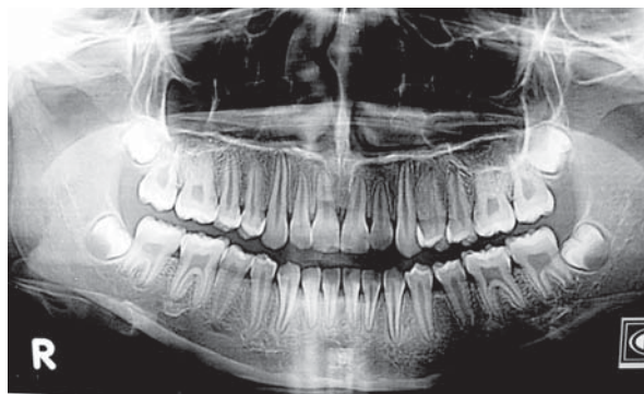
Figure 01: Orthopantomographic view of the female garment worker showing the developing third molar.

Radiographic examination showed that both the maxillary and mandibular third molar crowns were completed but the roots have not yet been formed (Figure 01). In accordance with the chart of Demirjian et. al. (Figure 02) the morphology matched with stage D where the crown formations were completed. 10 This finding was subsequently compared with Table 1 provided by Mincer et. al. 11 Stage D of mandibular third molars development had a mean age of 16.0 years with a range of 14.36 to 17.64 years at one standard deviation. As the morphology of the tooth formation of the female was in D stage, the probability of this female being 16 years was possible.