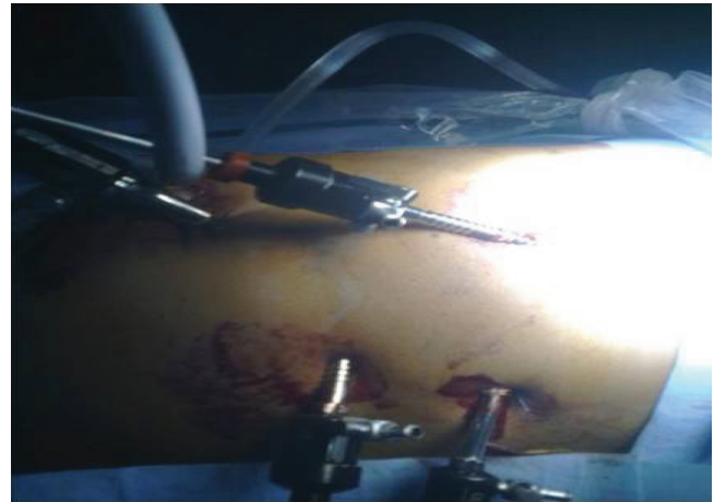
Figure 1: Port placement for pericardectomy

Patient was started on orals within 12 hours and discharged on the fourth postoperative day after removing