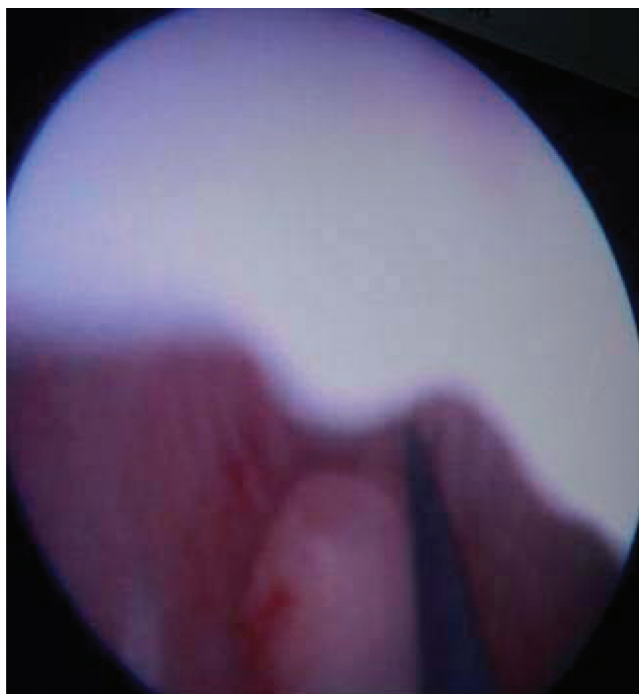
Figure 3: Urethroscopic view of PUV