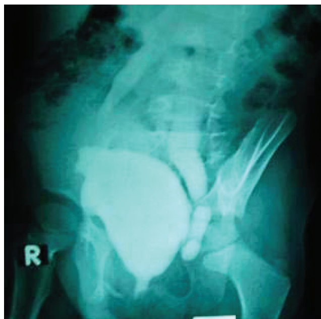
Figure 2: Bilateral VUR