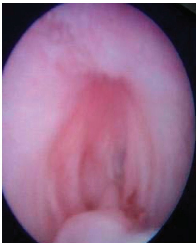
Figure 4: After fulguration of PUV

uncomplicated cases the child was discharged on oral antibiotic on the first postoperative day. In children with VUR, long-term uroprophylaxis and periodic urine cultures were advised. Patients were followed up at 7 days, 1 month, and 3 months,