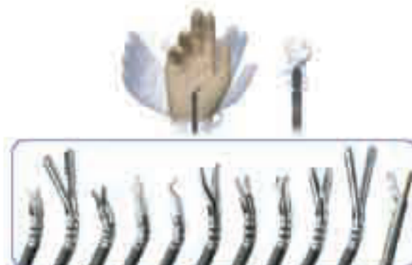
Figure 5: EndoWrist – 5 mm Instruments