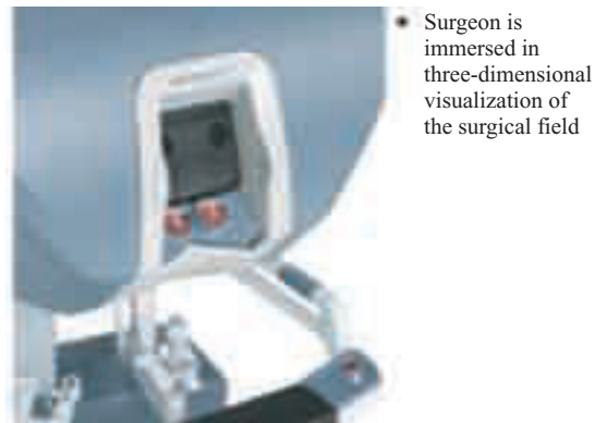
Figure 2: Da Vinci surgical console