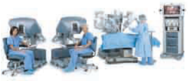
Figure 1: da Vinci ® Si ™ Surgical System

In cases of demanding tissue dissection or when an intraoperative change of the operative field is necessary, a fourth robotic arm could be of great benefit. A new edition of the 4 th arm da Vinci system is currently available. A fourth arm additionally obviates the need for the presence of an assistant surgeon and thus enables one-man surgery.