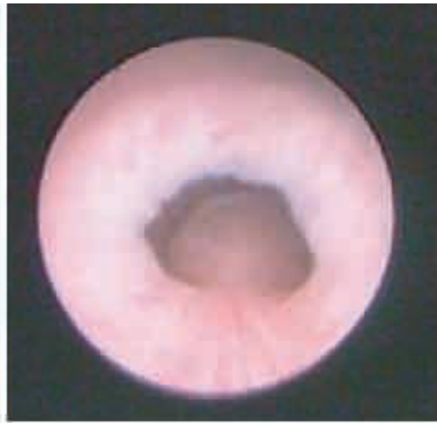
Figure 1: COPUM