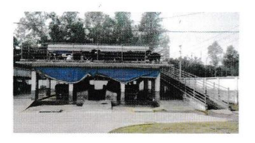
Fig.1: Multilayer cattle shed at RDA

and disposal of urine, faeces, wash water, feed refusals to a biogas plant directly for anaerobic digestion. Following application of a mixture of urine, faeces, flash water with feed residual produced by 130 cattle heads connected to the ground pipeline for discharging to biogas plant for anaerobic digestion to get biogas and bio-slurry automatically with gravitation flow. This two floors type of cattle shed was subjected to a constant airflow through crossventilation and sufficient sunshine to keep the floor dry and clean. With this system about 70-80% waste materials transferred automatically and the rest amount was transferred manually to biogas digester (Fig. 1).