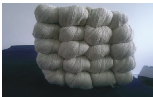
Figure 4: Cotton fibre

Note: Count: The “count” of a yarn is a numerical expression which defines its fineness.(Booth, 1996).