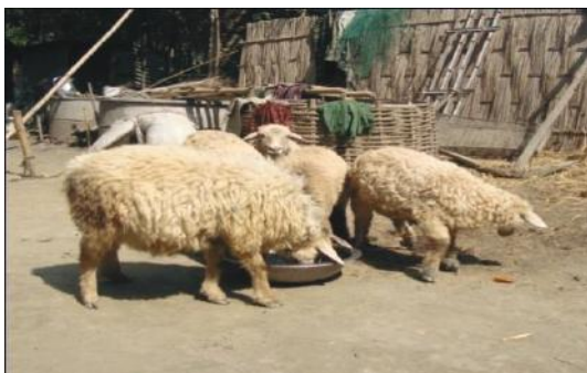
Figure 1: Rearing of local sheep