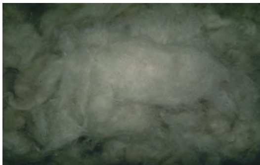
Figure 4: Cotton fibre

Raw sheep wool was washed with detergent and carbonized with 8% H_2SO_4 at normal temperature. Raw jute fibre was treated with sodium hydroxide, sodium carbonate and hydrogen peroxide at boiling temperature.