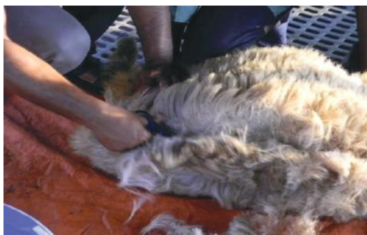
Figure 2: Shearing of local sheep