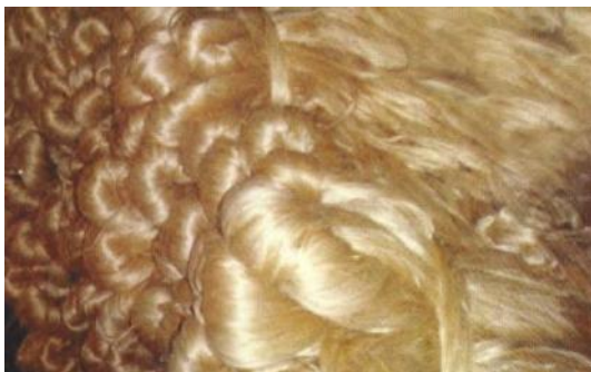
Figure 3: Jute fibre