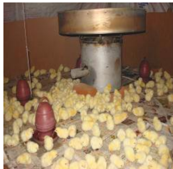
Figure1. Non -electric chick brooding device at farmer's condition

Dissemination Project (Dhamrai, Dhaka; Dinajpur Sadar and Noakhali Sadar Upazila). A total of 30 farmers were selected and imparted training on the use of the brooding device before field experiment. Among them a total of 12 interested poultry farmers were selected for experiment on the basis of their interest and capacity of rearing 500 and 1000 chicks. The experiment was conducted during November 2010 to March 2011. A total of 8 sets of special designed brooding devices were prepared having different sizes (e.g. Height x Diameter = 38cm x 38cm; 40.64cm x 40.64cm; 43.18cm x 45.72cm; 45.72cm x 60.96cm; 40.64cm x 45.72cm; 40.64cm x 60.96cm; 38cm x 45.72cm; 45.72cm x 45.72cm) with single and double lower outlet of the drum. The diameter of the hover is