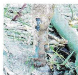
Fig 7. Photograph of healed skin at 24 th post-treatment day with Dad Mardan ointment

In case of control group (Group A), the lesions were aggravated gradually. A 5.51% lesion area increased at 24th day from the first inspection in untreated calves. Our present findings were same as Hossain et al. , (2002). There was no adverse effect found in the calves those were treated with ointments of the indigenous medicinal plants against lesions. Bagherwal (1999) also reported the same about the adverse effect on treatment by indigenous medicinal plants.