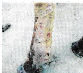
Fig 4. Photograph showing the lesion before treatment with the combined (Dad Mardan + Ata) ointment