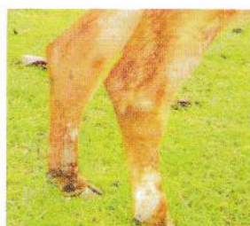
Fig 5. Photograph of healed skin at 21 st post-treatment day with combined (Dad Mardan + Ata) ointment