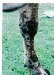
Fig 6. Photograph showing the lesion before treatment with the Dad Mardan ointment