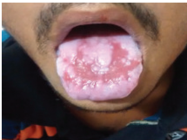
Fig.-1: Paraquat-tongue: just after poisoning

considerably. But, he still had tachypnoea (36 breaths/min) and tachycardia (114 b/min). Oxygen saturation increased to 88%. Serum creatinine became normal with adequate urine output. The patient was discharged at 4 weeks of hospital admission with high dose oral steroid and antioxidant therapy.