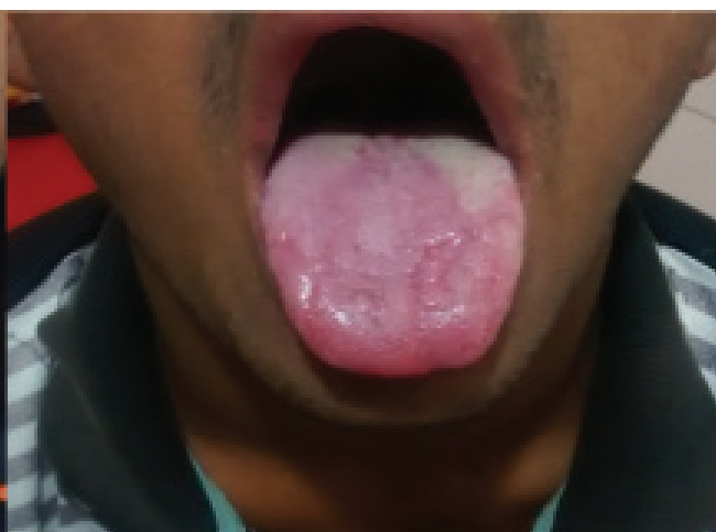
Fig.-2: Paraquat-tongue: one month later