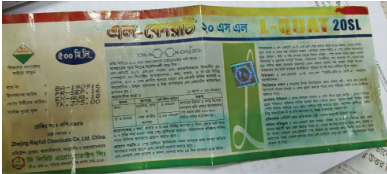
Fig.-3: The covering of the bottle of poison showing its ingredients