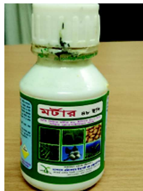
Fig.-1: The brought specimen showed OP compound Morter (Chlorpyrifos and Cypermethrin)

A 14 year old girl presented to the Dhaka Medical College Hospital (DMCH) in Bangladesh complaining about weaknesses of lower limbs and dropping of upper eyelids of both eyes. Upon further enquiry, the patient revealed the consumption of organophosphate compound (Chlorpyrifos with Cypermethrin) intended to commit suicide 6 hours ago after taking approximately 20 mL of combined product with the trade name of 'Mortar'. She did not receive any treatment outside the Hospital.