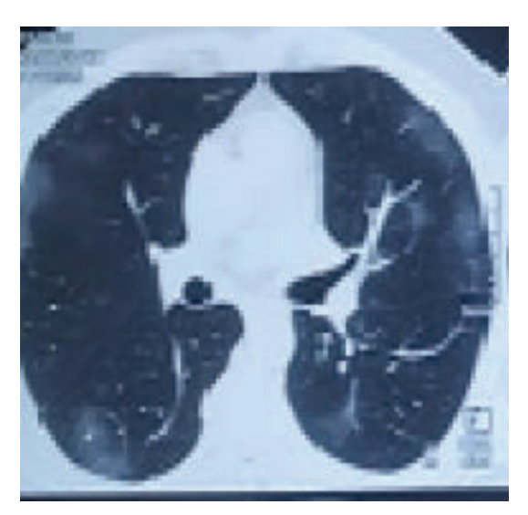
Fig 1 a&b: GGO in axial section initially visible on right side and later bilateral peripheral in all territory

be observed in time bound findings in HRCT of chest. A middle age RTPCR positive for SARSCoV-2 was investigated with the sensitive HRCT on 6^{\text{th}} day of illness with subsequent folow up on 9^{\text{th}} day.