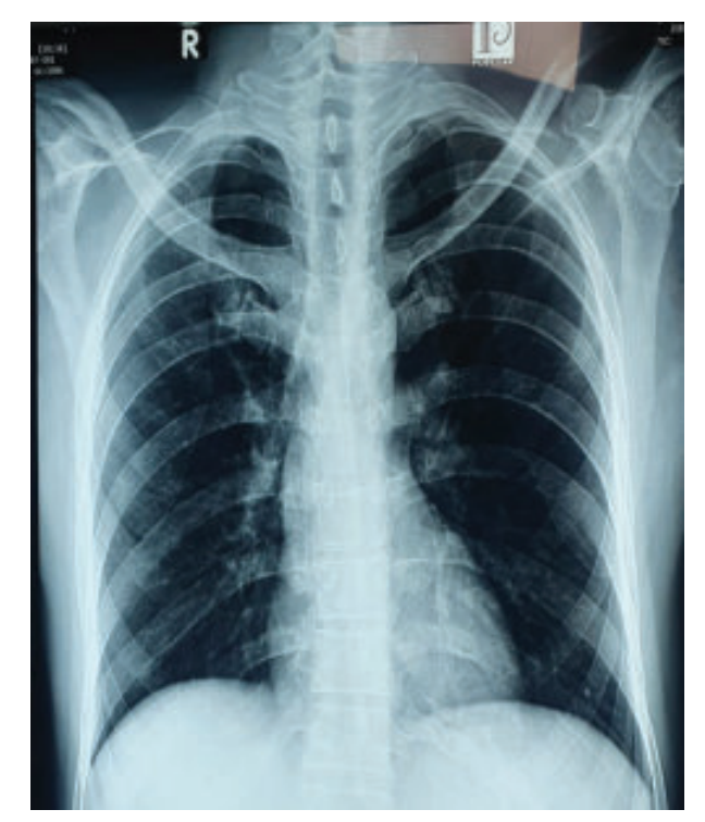
Fig.-1: Chest X ray-Normal