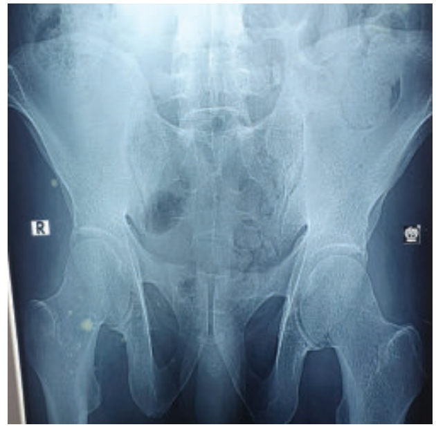
Fig.-2: X ray SI Joint- Normal