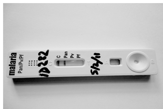
Fig 1: Immunochromatographic test -positive for P. malariae/ovale

The patient was treated with oral quinine therapy and recovered rapidly.