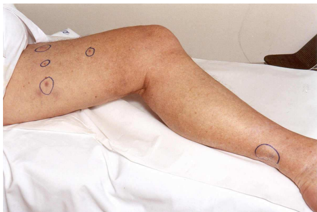
Figure 3: 20 of 21 melanomas completely regressed after systemic TAT. The initial sizes of the larger tumours are shown as blue rings. Post-TAT tumour beds revealed a complete absence of viable melanoma cells.

The observation of responses without any toxicity indicates that targeted alpha therapy has the potential to be a safe and effective therapeutic approach for metastatic melanoma.