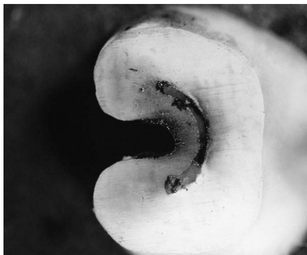
Figure 1: Example of Type 1 (continuous C-shaped canal)

In the present study, the total occurrence of C-shaped canal among the 241 extracted human molars is 9 cases or 3.73%. The low percentage of occurrence can be explained by inclusion of all the molars, which is both maxillary and mandibulars in this study to prevent bias, although Bolger (1988) reported that it is only common to be found in mandibular second molars 15 . Nevertheless, 100% of C-shaped canals were only found in lower