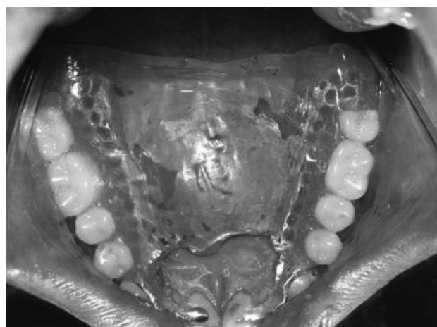
Fig 4: Final restoration of the occlusion of patient with cast partial denture