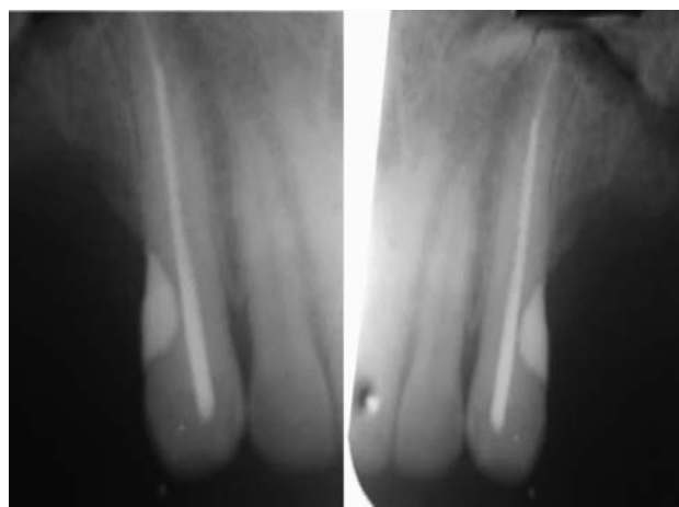
Figure V5: Follow up radiographs after 1 year of treatment showing complete cessation of resorption which the resorption approximated the pulp, followed by flap reflection and removal of the smear layer from the tooth surface, and cervical restoration with glass ionomer cement. Finally for prosthetic rehabilitation, a cast partial denture made of cobalt chromium alloy was delivered to the patient (Figure IV4). The patient was kept under a regular follow up every three months to check for progression of disease. { A follow up radiograph is added for reference {Figure-V5}