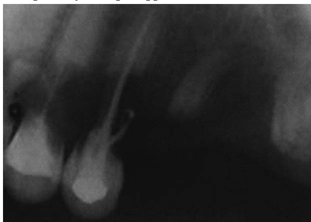
Fig 112: Intraoral periapical radiograph taken during the first visit showing progression of the resorption in 24, 25 (RCT treated).{This radiograph was taken in our hospital when the patient reported to us and as mentioned in the report ,the general dentist tried to extract the 26 and he left root stumps which were eventually extracted in our hospital}