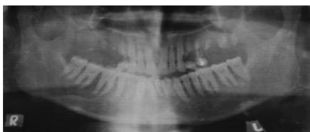
Fig 3: Orthopantomograph showing severe cervical resorption of multiple upper teeth.