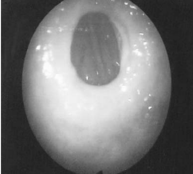
Figure I: A palatal perforation as seen from oral cavity