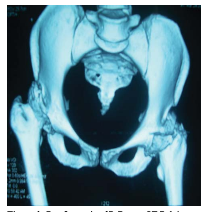
Figure-2: Pre Operative 3D Recon CT Pelvis