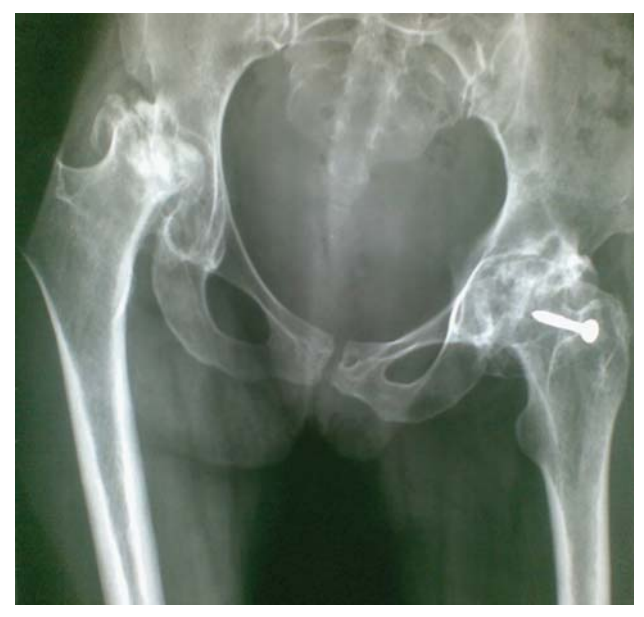
Figure-1: Pre Operative X-Ray Pelvis

Postoperative radiographs of both hips showed the presence of cemented total hip prosthesis in good alignment.