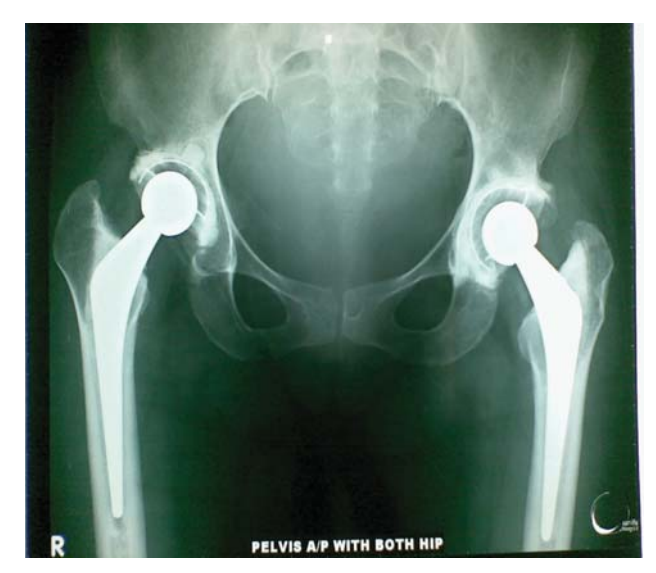
Figure-3: Post Operative X-Ray Pelvis