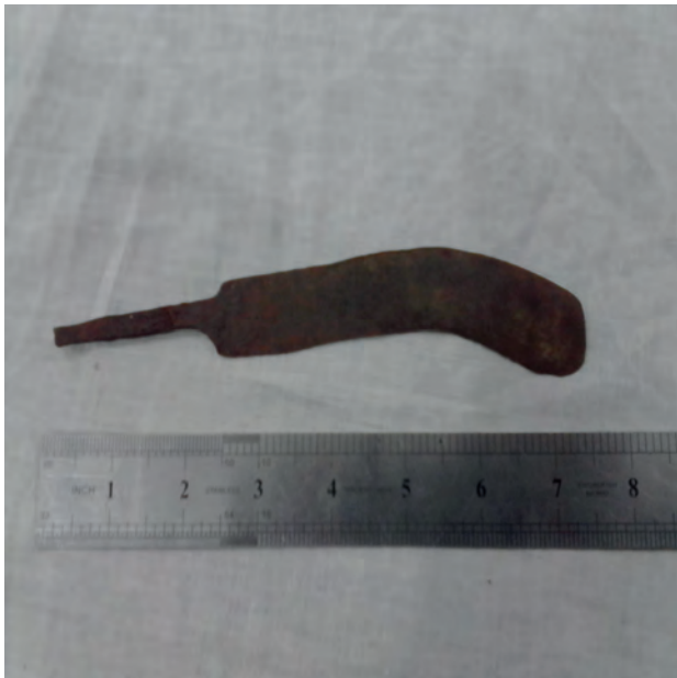
Fig-3: Knife removed from stomach measured about 7.5×1.5 inches with one edge sharp cutting and one end pointed.

and Diagnostic Center Joypurhat, Bangladesh on 20.11.2009 with the complaints of severe abdominal pain repeated vomiting for five days. She had history of repeated epigastric pain with infrequent vomiting and was treated by local doctors with omeprazole without further tests. USG abdomen & X-ray abdomen showing doubts about the presence of a large foreign body in abdominal cavity.