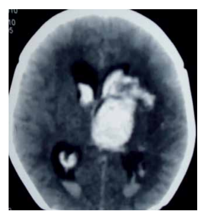
Figure1- Shows bilateral IVH (affecting left side more than right side), with periventricular haemorrhagic infarcts i.e Grade IV IVH, associated with Post haemorrhagic hydrocephalus.