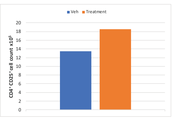
Figure 3. Regulatory T-Cell Populations after 24 hours of incubation.

We co-cultured the hUC-MSCs with PBMCs and examined directed autoimmunity. hUC-MSCs were co-cultured with PBMCs in the treatment group, and T-reg cell generation was compared with that for the control group after 24 hours of incubation. We found that hUC-MSCs significantly increased the T-reg cell population when co-cultured with PBMCs derived from SLE patients (P < 0.001).