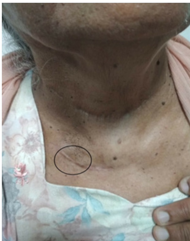
Figure 2 Ectopic carcinoma ex-pleomorphic adenoma was removed from the circled site

beyond the capsule would be diagnosed as invasive CEPA. Invasive CEPA is further divided into microinvasive if the extracapsular invasion is 1.5mm and less; and frankly invasive if beyond 1.5mm 9 .