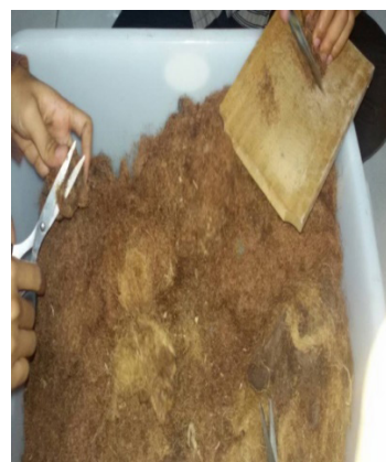
Figure 1. Characteristics of collected fresh corn silk (a) and oven-dried corn silk to be extracted (b)