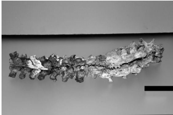
Figure 2: The evidence for laminectomy of the vertebrae.

discovery. Anthropological examination revealed that there was evidence of a laminectomy below the 9th thoracic vertebrae and fusion of the lumbar vertebrae (Figure 2). However, there was no evidence of recent injury. The sex, age, stature of the victim were estimated as male, 50-60 years old and 159-169cm, respectively, and the postmortem interval was estimated to be within one year.