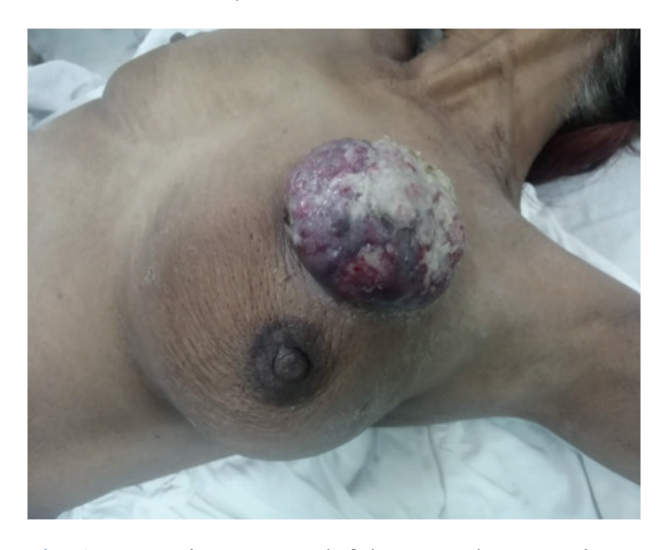
Fig. 1. Fungating mass at left breastat the upper inner quadrant

Musculoskeletal examination was unremarkable. There was no bony tenderness.