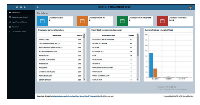
Figure 1. CIDIA alert system dashboard in Indonesian language implemented in PHCs

CIDIA alert system is an application based on several references including textbooks, MIMS, journals and other DDI alert systems for the specific use of DDI detection in primary, secondary or tertiary health care services. As depicted in Figure 1, the CIDIA alert system dashboard includes number of prescriptions, number of daily prescribed drugs, brand name of drugs and number of daily DDIs. Additionally, the CIDIA alert system can detect DDI incidence and categorize DDI as mild, moderate, or serious (Figure 2). The CIDIA alert system was registered in the intellectual property rights of Indonesian Ministry of Law and Human Rights as an alert system with the certificate number EC00201978384.