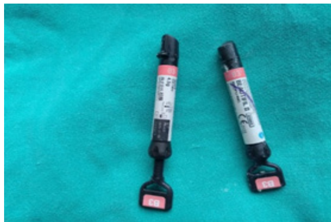
Fig1. Fluoride releasing, highly esthetic, S- (PRG) pre reacted Glass ionomer technology based packable composite material

Group D: Application of the respective composite material with a dentin adhesive (G-Premio Bond for Group 2) and selective enamel etching using 37% phosphoric acid (Figure 1).