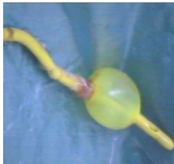
Figure 2: Pediatric Foley catheter balloon

The maintenance of the freshly separated uterine cavity after any uterine forced intervention is an essential prerequisite for prevention of subsequent adhesion formation, whereas rapid endometrial re-growth might be enhanced by oestrogen and progestogens cyclic administration 30 .