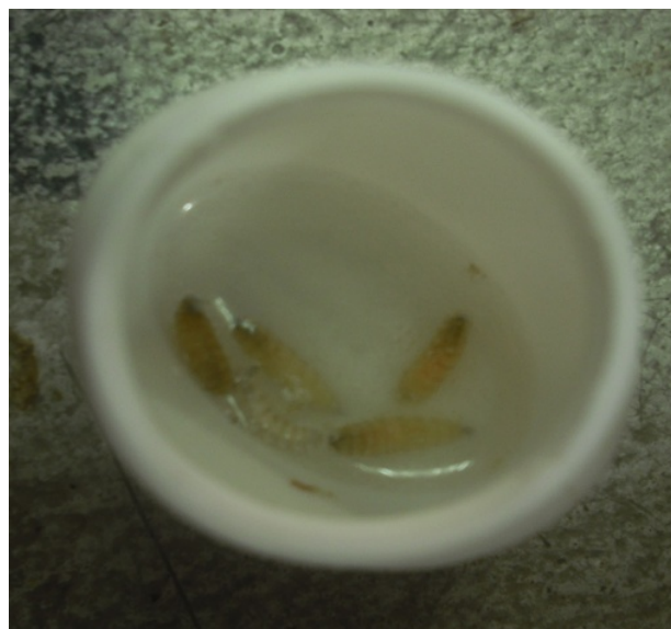
Figure 2A: Larvae removed from the wound

Follow up examination on the 6 th visit (28 October, 2010), revealed decrease in the gingival and palatal swelling and near complete reduction of palatal perforation with reattachment of the palatal gingivae and mucoperiosteum.