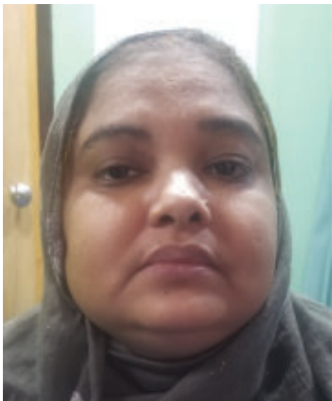
Fig.-4: Complete resolution of right sided ptosis at 4 weeks of treatment with prednisolone

In 1988, THS criteria were provided by the International Headache Society (IHS), and further revised in 2004 (Table I).