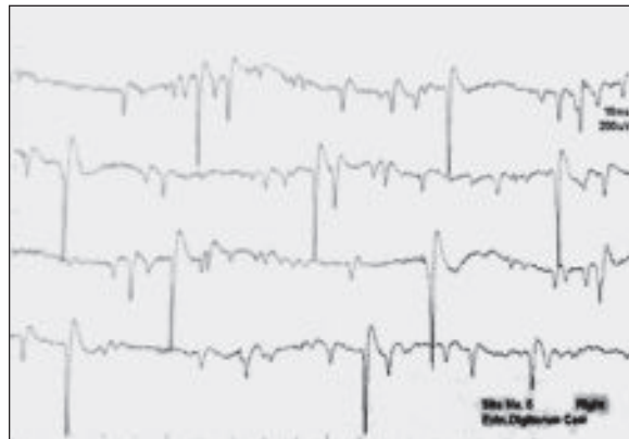
Fig.-3: EMG tracing of the patient