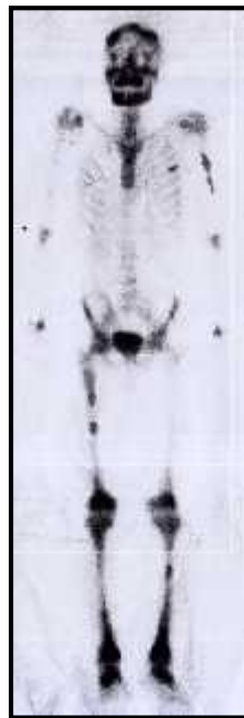
Figure 2: Whole body Bone scan demonstrating increased radiotracer uptake in several areas of bone.