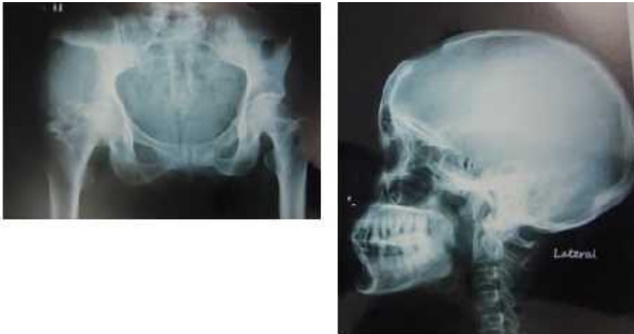
Figure 2. a) X-ray of pelvis showed huge soft tissue mass in right ilium. b) Lateral view X-ray of skull showed lytic lesion on frontal skull bone

X-ray of pelvis showed huge soft tissue mass arising from right iliac bone (Figure-2, a). Similarly X-ray of skull depicted lytic lesion on posterior aspect of frontal region (Figure-2, b).