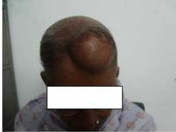
Figure 1: A 55 years old female presented with papillary thyroid carcinoma with metastatic mass in frontal region.

X-ray of pelvis showed huge soft tissue mass arising from right iliac bone (Figure-2, a). Similarly X-ray of skull depicted lytic lesion on posterior aspect of frontal region (Figure-2, b).